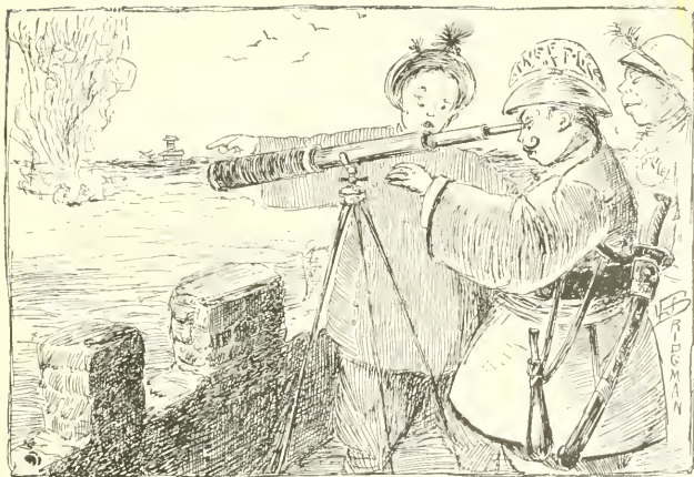
YE MYSTERY IS SOLVED.